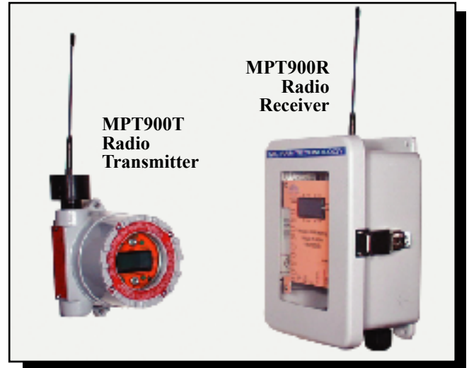
Wireless Radio Transmitter (MPT900T) and Wireless Radio Receiver (MPT900R)

The Mil-Ram Wireless Telemetry System is Multi-Process in that any 2-, 3- or 4-wire field installed process transmitter/transducer ( temperature, pressure, humidity, flow, pH, conductivity, etc. ) that generates a 4-20mA signal can be equipped with a radio transmitter and the data continuously sent to the control system via wireless communications. The radio transmitters/receivers utilize advanced data recognition techniques to ensure data reliability and integrity; corrupt data is automatically rejected. The radio transmitters/receivers have LCD displays for easy configuration which simply involves selection of specific addresses for each field installed 4-20mA transmitter. Addressing provides a unique identity for each 4-20mA transmitter to eliminate cross-talk interference with other devices.